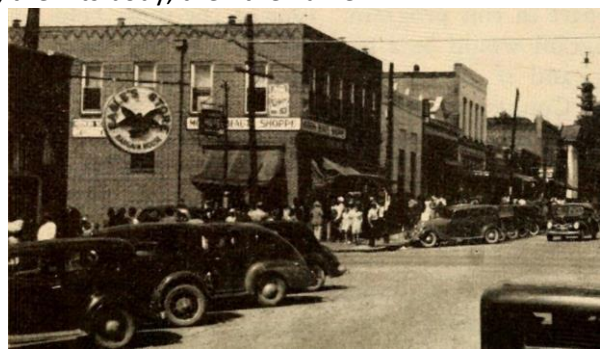
Pre-July 1940 photo showing the Eagle's Store sign on far left. Then Mullins' brick store, Peoples Savings Bank, First National Bank, Chicago Sales first location, 2 story Wilson building, other buildings then courthouse.

But things keep moving ... the Eagle's Store puts up a "novel electric sign" which will "flash on and off, first the wings of the eagle, then its body, then the name."