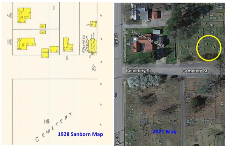
1928 Sanborn map (left), modern map (right). Circle indicates location of church.

It is important to note that the Salem Baptist Church (black) in Clanton is not to be confused with the Salem Missionary Baptist Church which was located near the Coosa River, northeast of Verbena. That Salem was flooded by the building of Mitchell Dam and was dissolved just before on October 22, 1921. Its members went to various nearby church congregations.