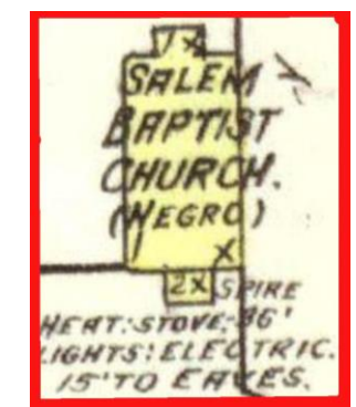
Expansion of Salem Baptist Church graphic in 1917 Sanborn Fire Insurance Maps showing building details.

On the 1917 Sanborn map the church was named specifically – "Salem Baptist Church (Negro)." In the expanded view of the 1917 church image there was a lot of information on the building. It was wood framed (yellow), one story (tiny 1 in the corner) building, with a one story porch on the back, a singled roof (the 'X'), and a 2 story (36? foot) "spire" in the front center. It was heated by a stove and the lights were electric (in 1917) and it was 15' to the eaves. These details were practically the same on the 1928 Sanborn map.