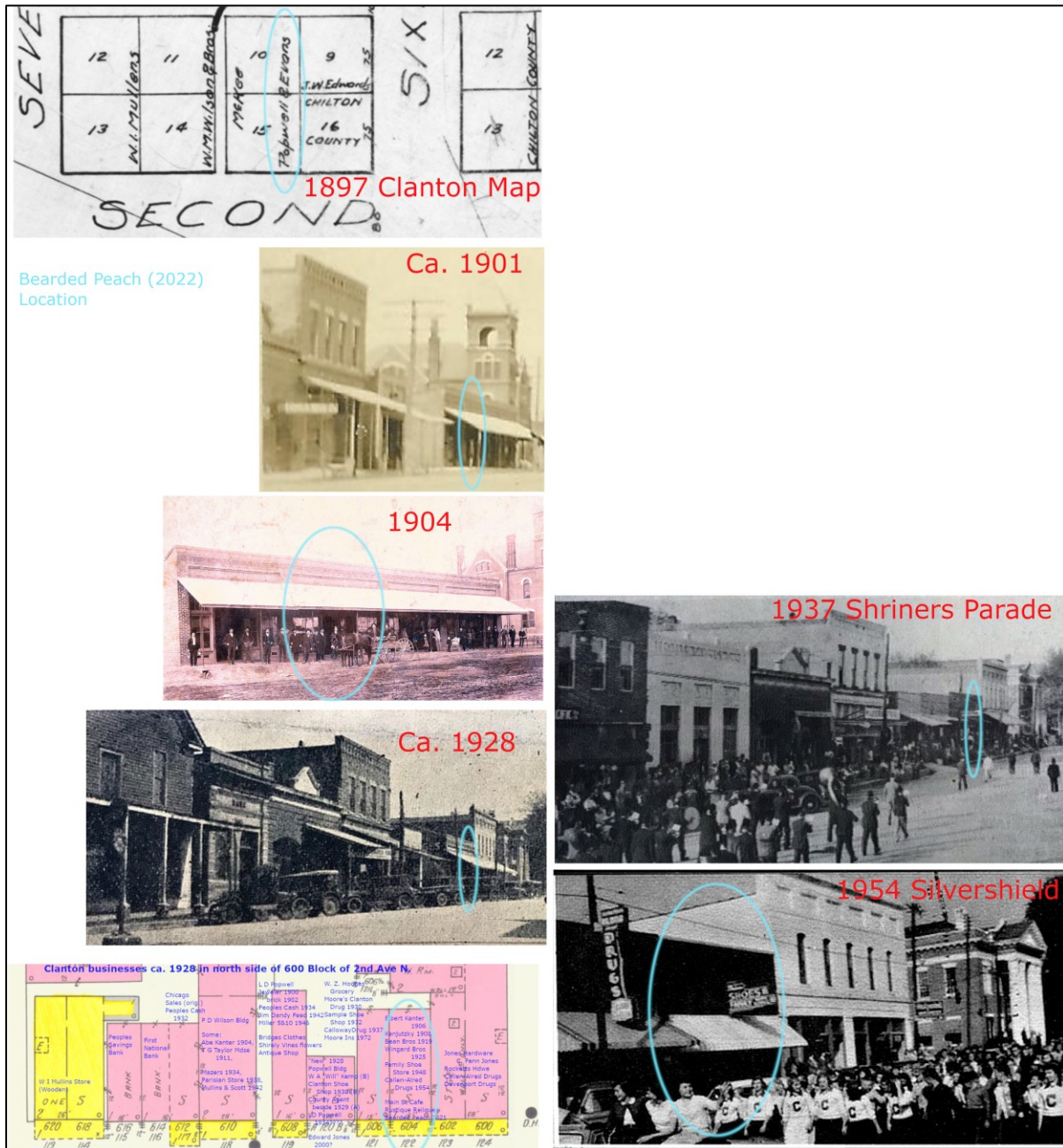
Photos the corner, location of modern The Bearded Peach circled.

1962 June - Clanton Building Supply Co. , known as Rockett Hardware , moved to new location across from the A & P store – which was the location across from First Baptist Church .