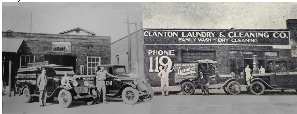
Clanton Laundry in the building on 6 th Street ca. 1927. This is a composite of two photos.

In December 1927 they moved to 6th Street just south of 2nd Avenue North. This building is now a vacant lot behind the old "Messer's" store (which is now a bank). Below is a photo in that time frame (1927 - 1930s) that is combined with a separate photo of the Nehi bottler that was across the alley. This was later Clanton Furniture.