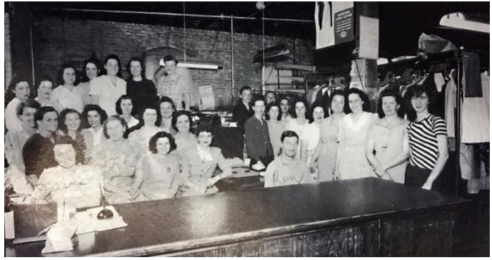
Interior views of the Clanton Laundry.