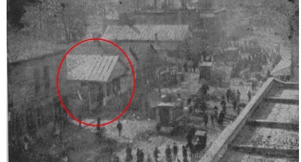
Union-Banner office: Oct 5, 1901 on 2<sup>nd</sup> Ave N.

The original Banner office was on the south side of 2<sup>nd</sup> Avenue North about where Chicago Sales would later be located; it was the next building over from the old wooden courthouse that was moved. About March 1902 it moved into a new building, the one shown on the 1917 Sanborn Fire Insurance map, across from the Courthouse on 6<sup>th</sup> Street. In November of 1921 The Union-Banner bought a lot in "block 11" and built a brick building for their office and printing. This location was on the east side of 6<sup>th</sup> Street just south of 2<sup>nd</sup> Avenue North by the alley and jail.