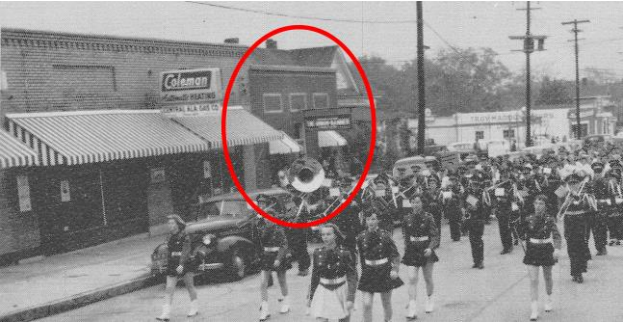
Union-Banner 6<sup>th</sup> St. office south of 2<sup>nd</sup> Ave N. from 1956 CCHS Silver Shield annual.

The Clanton Press ceased publication in April 1919 and the equipment was bought by The Union-Banner in 1922.