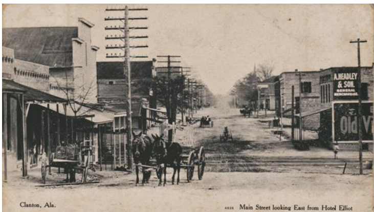
Ca 1908 postcard of Clanton, 2<sup>nd</sup> Ave N looking east from 8<sup>th</sup> St. A. Headley & Son store by RR on right side.

Many of the earliest photos of Clanton showed "Main Street" looking down 2<sup>nd</sup> Avenue North from 8<sup>th</sup> Street. In most of those, one of the most prominent features was the large two story brick building on the south side, sitting by the railroad.