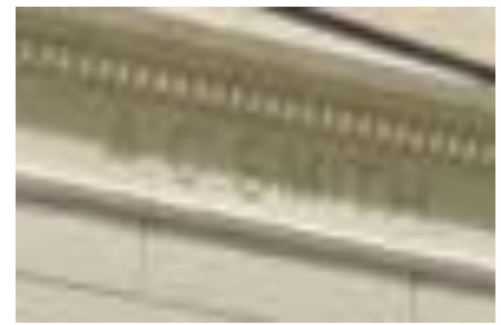
Photo of the A. C. Smith building ca 2016 and a close up of the upper roofline.

The Union Banner has been located in a wooden frame building "at the rear of the courthouse" and moves into the upstairs of the A. C. Smith building at the end of 1915. A few years later it will move into its own building on 6<sup>th</sup> Street.