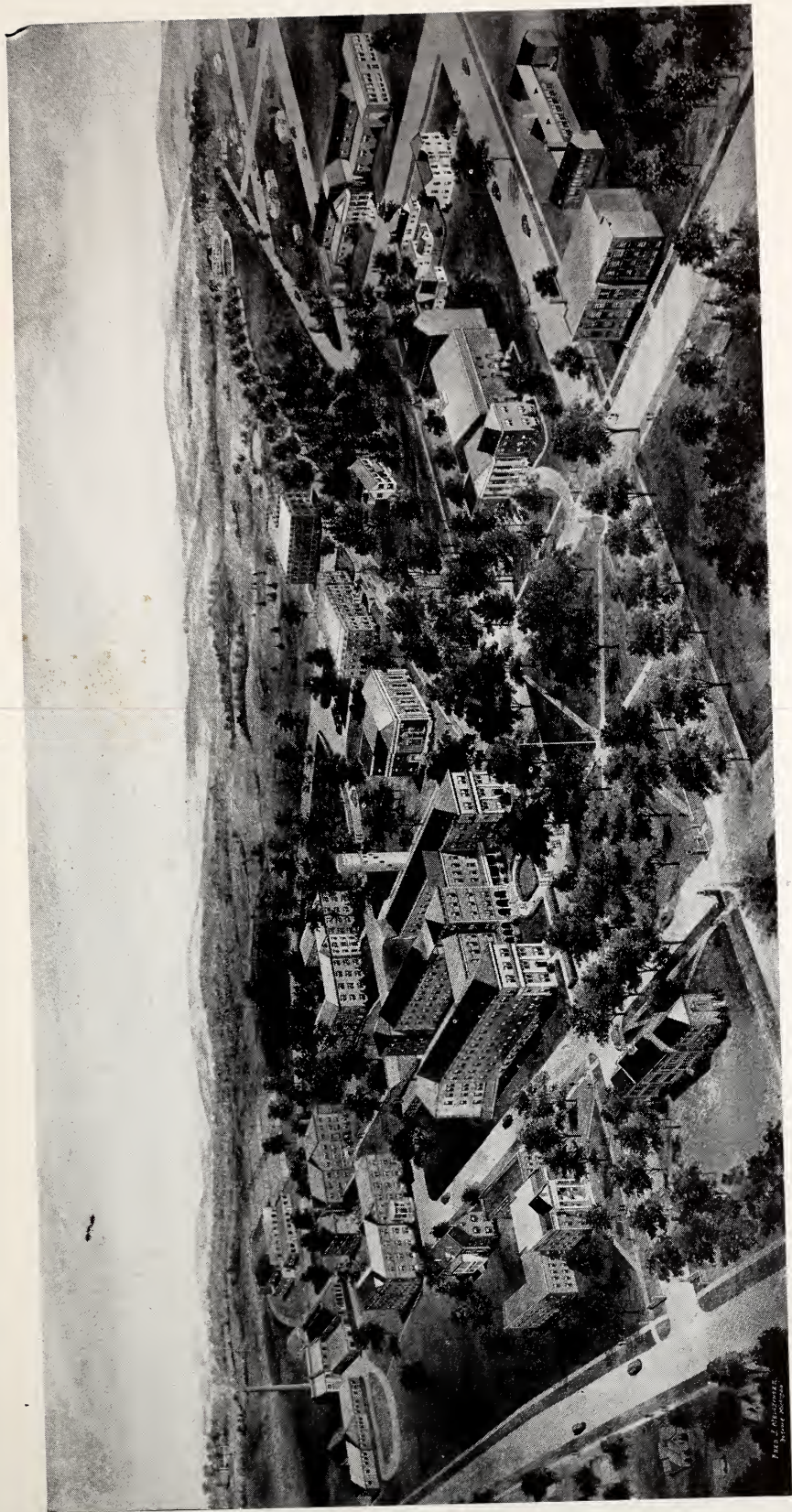
A BIRD'S-EYE VIEW OF ALABAMA COLLEGE